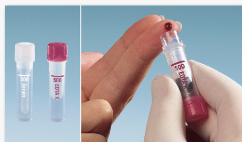
Microvette® 300/500 Blood collection with collection rim

More information is available on request.